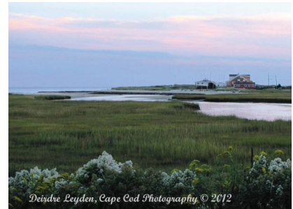
Sunset and view were spectacular!